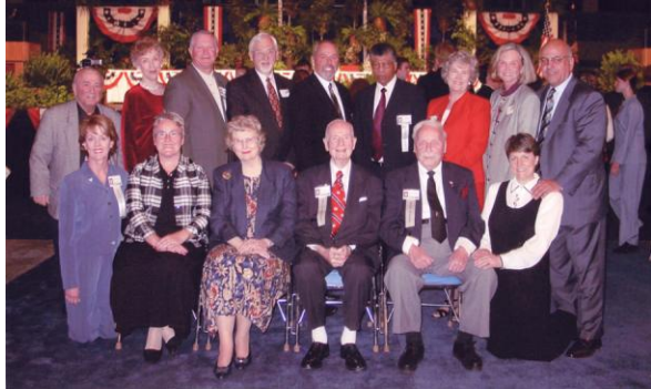
USAD Board of Directors in Erie, Pennsylvania in 2003.

Upon the advice of the Field Committee, a procedures manual was developed for the USAD National Competition in 2003. The manual was designed to serve as a guide for those involved in the planning and administration of the USAD National Competition. It listed the responsibilities of the host state and the competition coordinator. USAD and the host